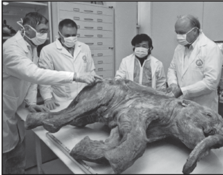
Scientists examine the baby woolly mammoth named Lyuba. If she had not been found, the spring thaw and a flooding river might have washed Lyuba out to sea.